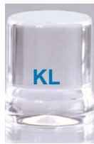
Ø 27 x 32