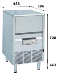
Stainless steel AISI 304